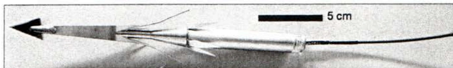
Figure 1. Satellite transmitter (Wildlife Computers implantable SPOT3/4) deployed in humpback whales in the Cook Island.

left or right flank of the whales from about 1–2 m ahead to the same level of the dorsal fin and usually within 2 m from the midline of the whale's body. Maximum penetration depth of the transmitters was approximately 17 cm. Tag deployment was accomplished with an 8-m pole deployed from a small motor boat, using the technique described in Heide-Jorgensen et al. (2003) and Zerbini et al. (2006). No noticeable immediate posttagging reaction was observed for four individuals, an increase in swimming speed was recorded for three, and a slight tail slap was seen for another whale.