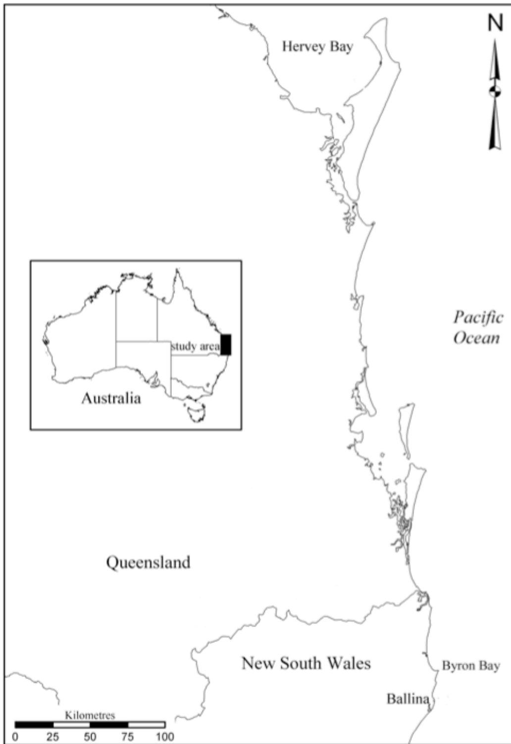
Figure 1: Map of 3 sites (Hervey Bay, Byron Bay and Ballina) in Eastern Australia where sloughed skin samples were collected from humpback whales.